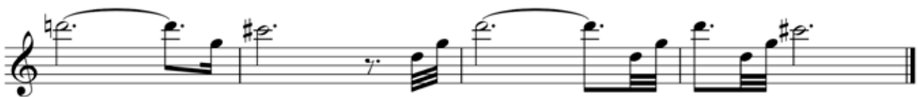
MAIN THEME VARIATION MOTIF

Now play the Main Theme Variation Motif. How does it differ from the Main Theme?